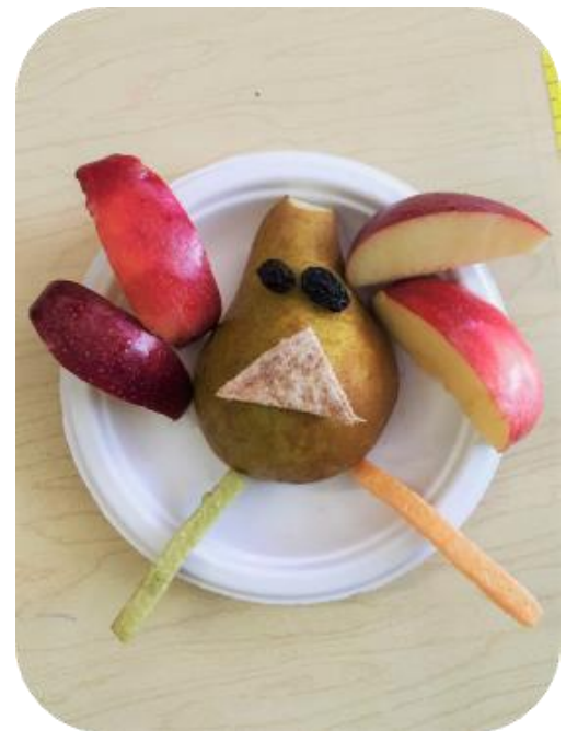
A fruit-filled “Turkey” thanksgiving creation from a Thomas Child Care visit.

Thomas Home Child Care plans to use their Champion Schools grant to maintain their Future Standouts program, a physical activity program that is perfect for the whole family. The child care facility will continue their partnership with Chris Edmonds, founder of the Athletic Training Unit (ATU), to provide an organized exercise program for their children and families on a weekly basis. These sessions will allow families to work out together and have fun at the same time. The ATU food truck will also be on site for families to purchase nutritious meals after their workout.