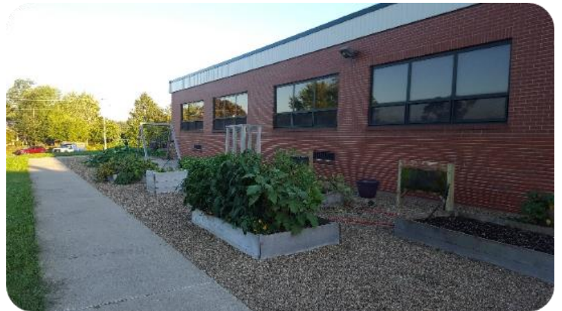
Greenock's school garden, captured during a past Meet Up.

Greenock will use their Champion Schools grant to teach children that healthy snacks can be inexpensive, easy to prepare and delicious. Children and families will learn nutrition basics, portion sizes, proper food handling and essential cooking skills. This program will complement Greenock's existing programming, which includes a combination science and cooking class called "Eat Your Science," as well as their Kids of Steel Running Program.