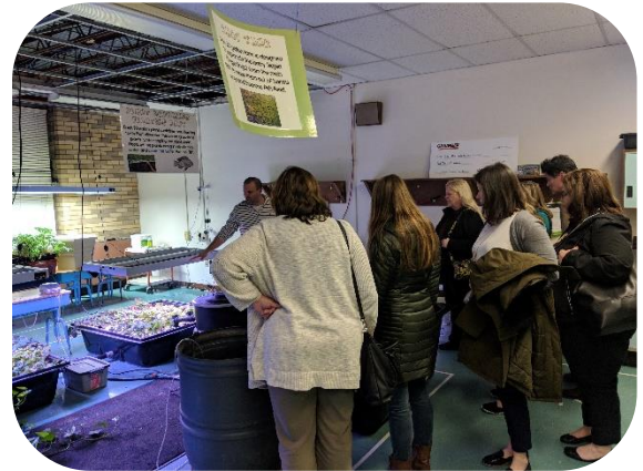
Meet Up at Regency Park Elementary School

Let's Move Pittsburgh launched the Champion Schools program in 2014 with the goal of supporting schools to build healthy environments for their students. In addition to funding for program supplies, Champion Schools Awards recipients receive toolkits with fact sheets, best practices, lesson plans and tips to promote healthier classrooms and lunchrooms. Professional development and networking opportunities are also provided for parents/caregivers, educators, food service staff and administrators. "Meet Ups," which are hosted at Champion Schools sites, allow participants to see other school programs in action.