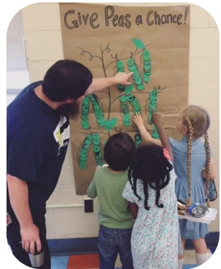
Students from Pittsburgh Montessori add their “peas” to the vine, after giving sugar snap peas a try in their lunchroom.

Pittsburgh Montessori Pre-K – 5 will use their Champion Schools grant to expand their Edible School Yard with edible shrubs, perennials and trees in their pollinator-friendly garden. The gardens support GROW Pittsburgh and seek to increase children’s familiarity with fresh fruits and vegetables.