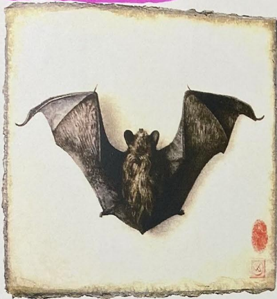
FIGURE 7.23 Victor Koulbak, Bat , 2009, silverpoint, watercolor on handmade paper, 10 × 12 1/2 inches (25.4 × 31.8 cm)