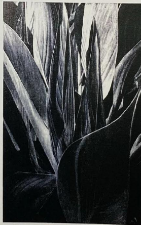
FIGURE 7.6 Marjorie Williams-Smith, Lines , 2017, aluminumpoint on black acrylic gesso, 9 3/4 × 6 1/4 inches (25 × 16 cm), private collection

GREAT BOOK! YOU MAY ALREADY OWN! WILL BE THIS CLASS REFERENCE.