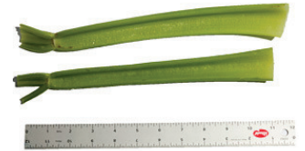
Celery: 1 cup diced or 2 stalks (11 to 12 inches long)