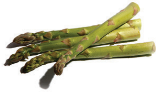
Asparagus: About 4 spears