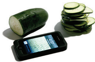
Cucumber: 1 cup sliced/chopped or about 1/2 of a medium cucumber (8 to 9 inches long)