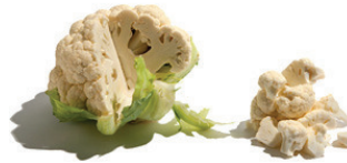
Cauliflower: A little less than a 1/4 head of florets