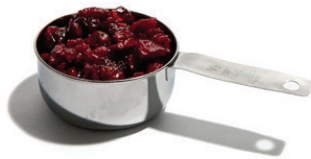
Dried Fruit: 1/2 cup