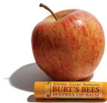
Apple: 1 small apple (about 2 1/2 inches in diameter, a little smaller than a baseball)