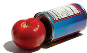
Tomato: 1 cup chopped or 1 large tomato (about 3 inches in diameter, about the size of a baseball)