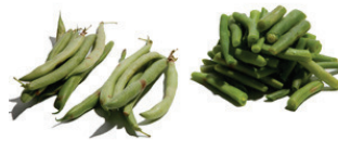
Green Beans: 1 cup cooked (we counted: It's about 19 to 20 beans)