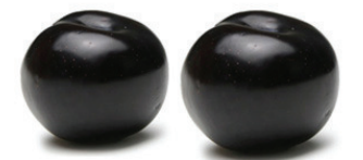
Plum: 2 large plums