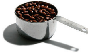
Beans, Cooked (black, garbanzo, etc.): 1 cup