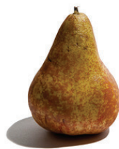
Pear: 1 medium pear