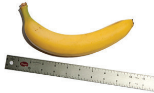
Banana: 1 large banana (8 to 9 inches long)