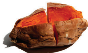
Sweet Potato: 1 cup mashed or 1 large baked potato (about 2 1/4 inches in diameter)