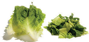
Greens, Raw (lettuce, spinach, etc.): 2 cups (about two large leaves of chopped romaine)