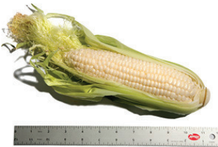
Corn: 1 cup of kernels or 1 large ear (8 to 9 inches long)