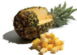
Pineapple: 1 cup chopped (a little less than 1/4 of a pineapple)