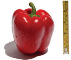
Bell Pepper: 1 cup chopped or 1 large pepper (about 3 inches in diameter)