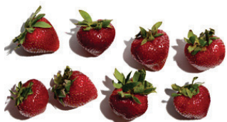
Strawberries: 8 large berries