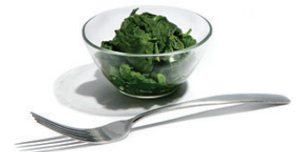
Greens, Cooked (kale, chard, etc.): 1 cup