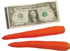
Carrots: 1 cup chopped or 2 medium whole carrots (6 to 7 inches long)