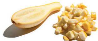
Summer Squash: 1 cup cooked/sliced/diced squash or 1 whole zucchini (7 to 8 inches long) or about 1/2 of a large yellow crookneck