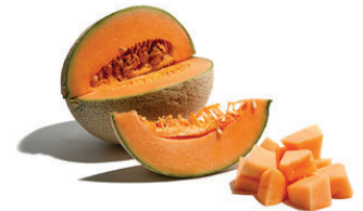
Cantaloupe: 1 cup diced or about 1/8 of a large melon