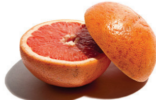
Grapefruit: 1 medium grapefruit (about 4 inches across)