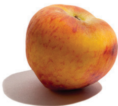
Peach: 1 large peach (about the size of a tennis ball)