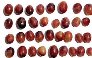
Grapes: About 32 average grapes